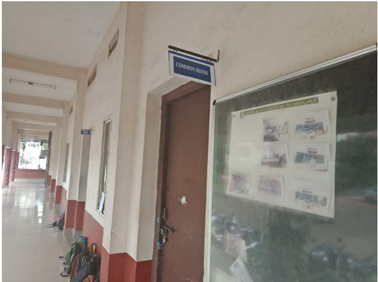
Common Room: Srinivas Institute of Technology, Mangaluru.